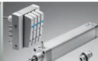
Everything from a single source