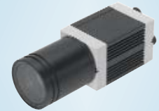
Checkbox Identbox CHB-IB