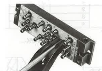
Clamping tubing onto fitting with pliers