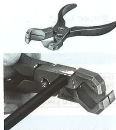
Chamfering alloy tube