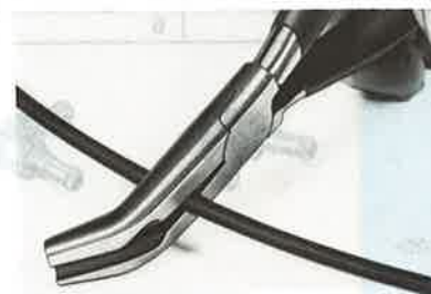
Cutting tubing to length