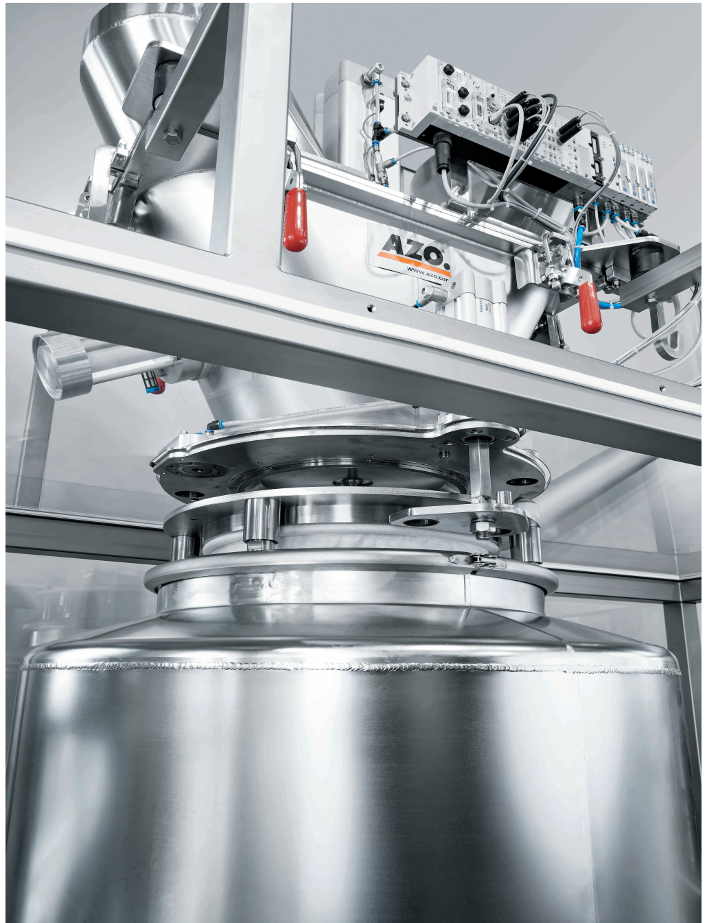
Linear actuators from Festo securely clamp the passive and active sections.

The container glides into places virtually soundlessly, approaching its destination with even motion: the CleanDock. Stainless steel elegance. Clean, sovereign and safe. Then it comes to a stop. The pneumatic gripping system of the active section extends from above, grips the container closure of the passive section and lifts it. Two to three air blasts indicate that the dosing element and target container are seamlessly joined. The flexible compensator of the passive section makes it possible to tare the scale positioned under the container precisely – independently of which product quantity it already holds. Then the filling of the bulk material begins. Once this process has come to an end, the active and passive sections detach from each other elegantly and cleanly and the container moves to the next filling station. What no one sees from the outside: almost the entire filling process has been controlled by CleanDock itself in a decentralised manner.