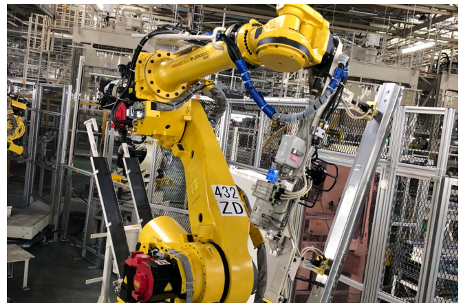
Body-In-White Material Handling