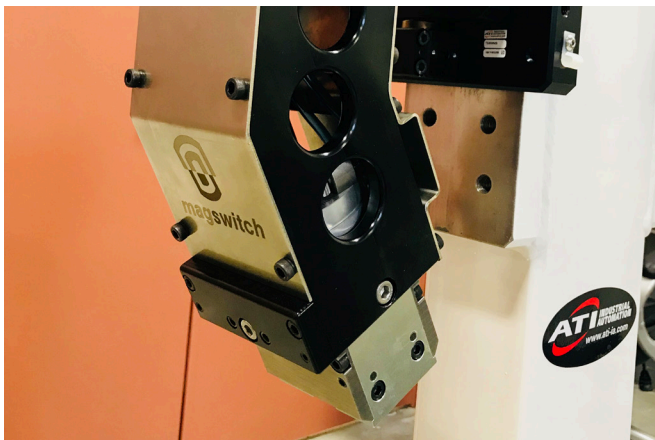
Bin Picking (AR50 EOAT Kit w/Armor with multiple applications)

Bin Picking, Assembly, Body-In-White, Pressure Vessel Fabrication, Press Line, Hot Stamping