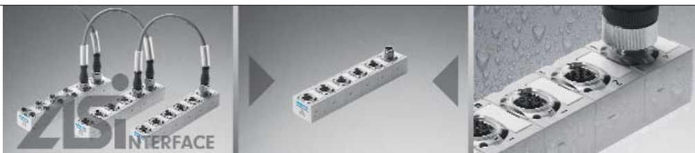
Bus 2 x M12: Simple expansion

Cut your installation costs – with these compact AS-i I/O modules and Festo as your single-source partner.