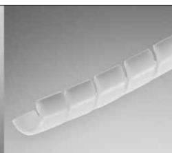
Tube protection sheath