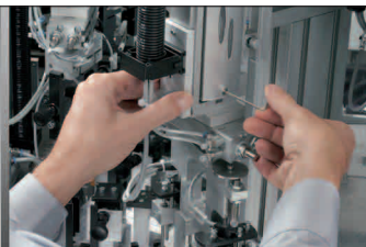
Full range of products & services