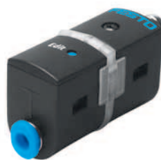
Pressure switch SDE-5