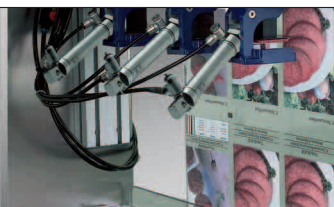
Meets application demands