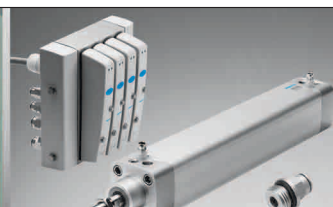
Everything from a single source