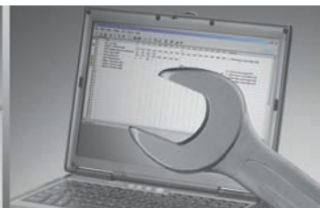
Basis for support