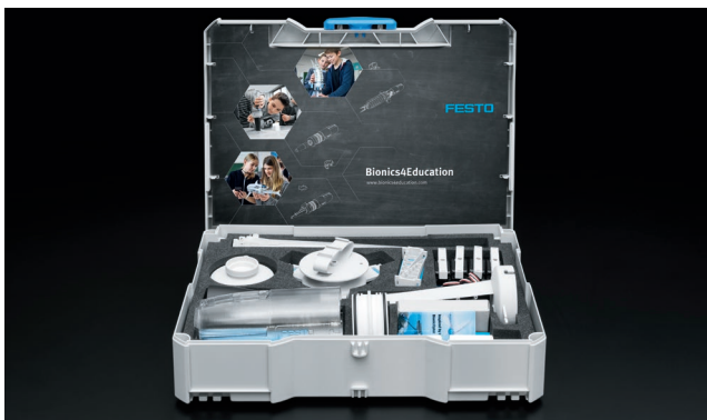
Bionics Kit shown with optional Systainer

Because all objects can be disassembled and reassembled, it is possible to create all three models one after another with one Bionics Kit.