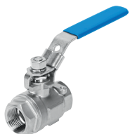
Ball valve VZBE, manual