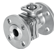
Ball valve VZBF