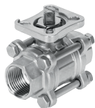
2-way ball valve VZBE