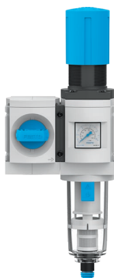
Standard application MS6-EMFR-...-B

Are you looking for a standard application ? Then the MS-Basic is right for you, for example our preconfigured combination of manual, lockable on/off valve and filter regulator.