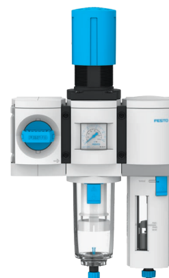
High-end solution MS6-EMFR-...-B + MS6-LF

The filter regulator LFR-B is available either with an integrated pressure gauge or a 1/8" connection, for example for round pressure gauges.