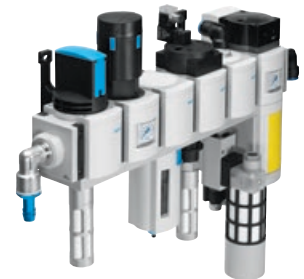
Service unit combination with MS6-SV-E

standalone operation possible. Tamper-proof covers are optionally available.