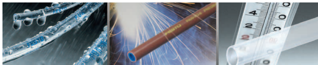
Hydrolysis resistant, ...