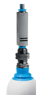
In-line version with ESG suction cup