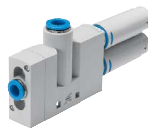
VN-30 with open silencers

Especially suitable for cases where there is heavy demand for vacuum and the intake air is dirty: The open silencers fitted as standard guarantee maintenance-free operation and a low noise level. Optional silencer sets can be fitted in cases where the maximum silencing effect is required.