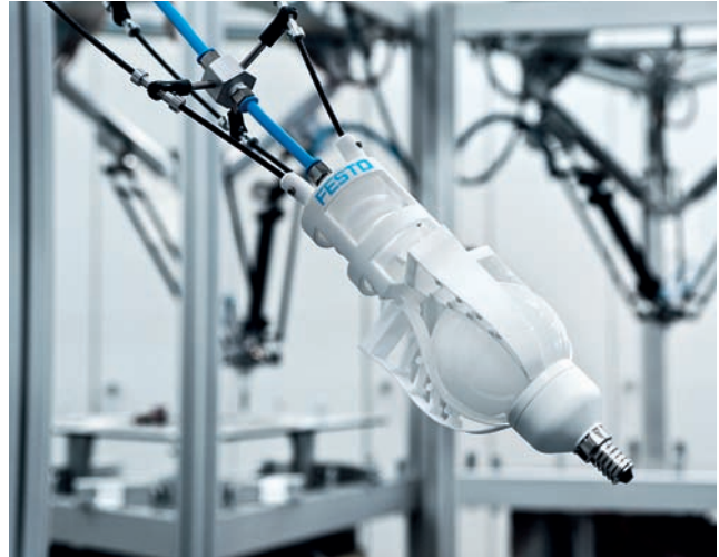
Adaptively gripped energy-efficient light bulb

Flexibility, lightness in relation to the mass to be displaced and energy efficiency are acquiring increasing significance in automation. The BionicTripod demonstrates the possibility of rigorously adopting bionic design principles for efficient, versatile automation. In the BionicTripod, the bionic Fin Ray® principle has for the first time been effectively realised for the requirements of automation in manufacturing processes.