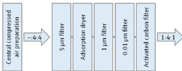
Filter cascade for compliance with class 1:2:1

The compressed air is used for transporting and mixing, as well as for food production in general. It comes into direct contact with the food. Because these foods are dry, even stricter requirements apply with regard to atmospheric humidity. Consequently, the following classification in accordance with ISO 8573-1:2010 is recommended in this case: Solid particles: class 1 Water: class 2 Oil: class 1