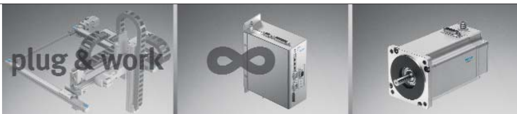
Single- and multi-axis systems

This new stepper motor series combines long service life and full positioning functionality with a low price. The two-phase hybrid stepper motor offers high torque, a high degree of protection and an industrial connector system. A brake and integrated encoder are available as options. The motors are backed by a range of matched gearboxes, available from Festo ex-stock.