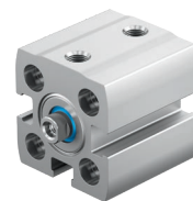
Compact cylinder ADN-S