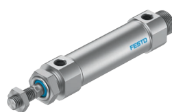
Round cylinder DSNU