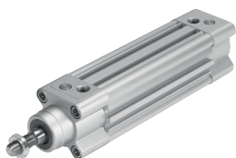
ISO cylinder DSBC