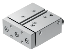
Guided drive DFM