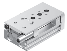
Mini slide DGST