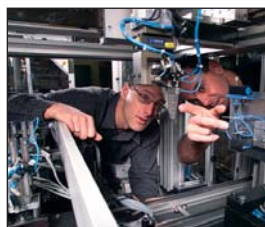
Quality and Inspection