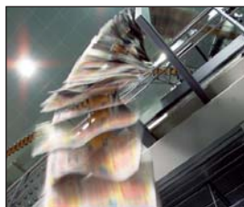
Paper and Printing

MPS® won the Worlddidac Award in 1998, 2000, 2002