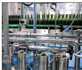
Food and Packaging