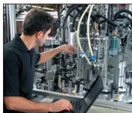
Assembly and Production