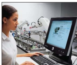
Design and Engineering