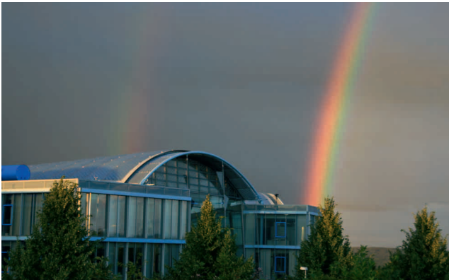
Optical analysis in the rainbow: sunlight in spectral colours

Optofluidics is a relatively new interdisciplinary technology that combines optics and fluidics. It extends to both the realisation of optical effects and components and the analysis of fluids in motion. Fluids comprise liquids and gases, but also bulk solid materials that flow through pipelines and their fittings.