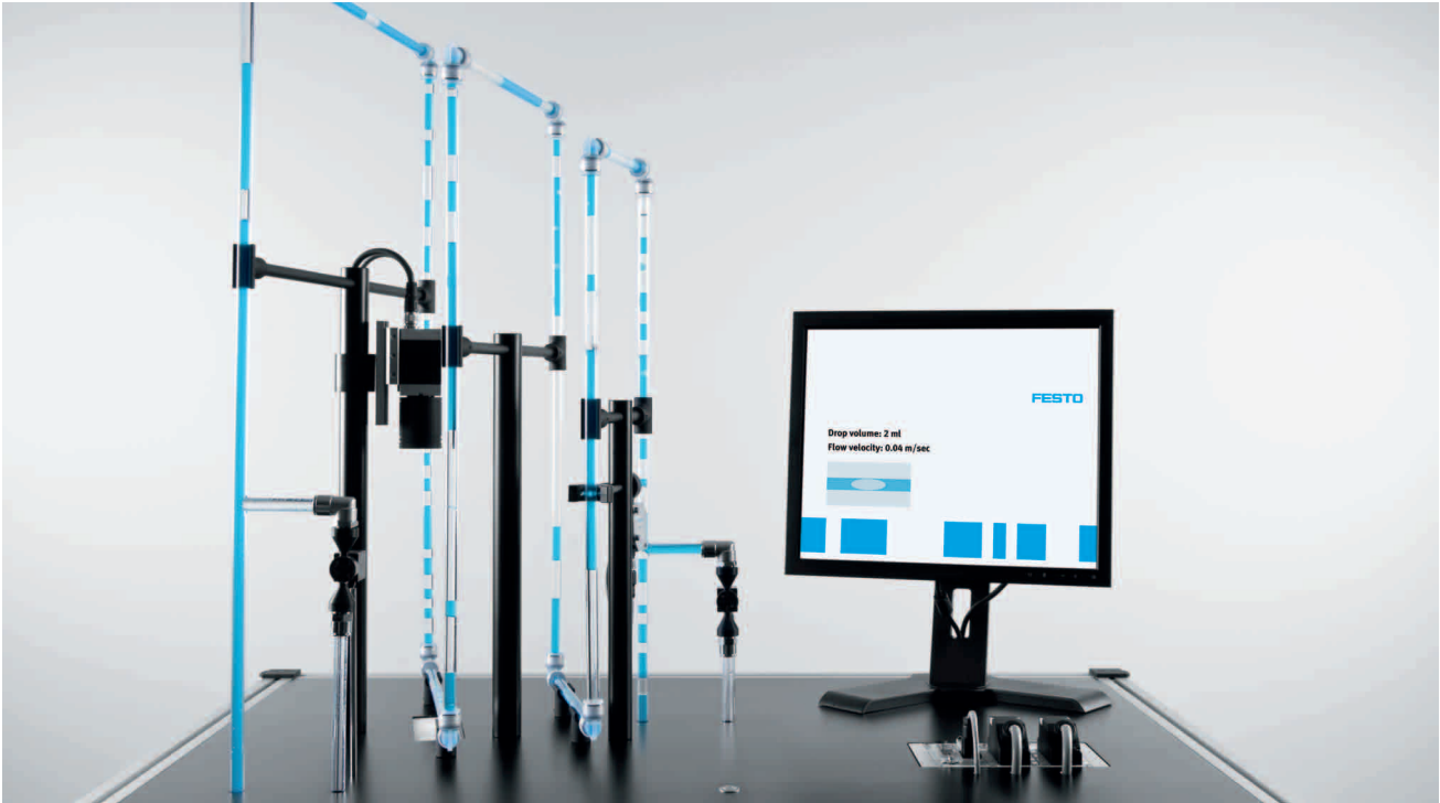
OptoFluidic: demonstration of optical analysis and separation processes