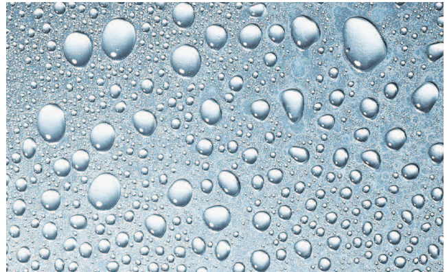
The lotus leaf: water droplets act as optical lenses

This technology furnishes diagnostic and analytical methods in which certain characteristics, constituents or parameters of fluids in motion such as density, volume, colour, or content of noxious substances are detected and evaluated. For this purpose, the fluid is charged with information that can be subsequently read by optical components. The fluid thus becomes a medium that carries in itself the code for optical analysis. Devices such as cameras and sensors visualize the diagnosis in real time, without the process flow having to be interrupted. In future, optofluidic analysis methods could replace time-consuming sampling and stabilize process flow, while reducing the number of components required and maintenance costs.