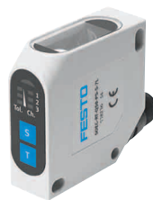
Colour sensor, type SOEC: sharp colour detection of different media in motion