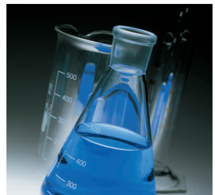
Possible application in the food and packaging industries or in the chemical and pharmaceutical industries