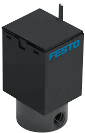
Solenoid valve, type VODA: precise metering and separation of fluids

The first station incorporates an optical sensor SOEC and a compact camera SBOC, which analyse the fluid in real time in terms of its composition and characteristics and evaluates parameters such as the transparent drop's volume. For this the in-house developed Software CheckKon and CheckOpti is used. A monitor connected to the camera system displays the collected data and allows continuous real-time monitoring of the processes.