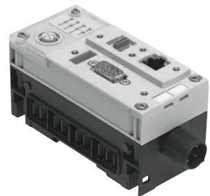
Front end controller, type CPX-CEC-C1: control of the overall application