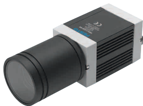
Compact camera, type SBOC: real-time analysis with no interruption to the process